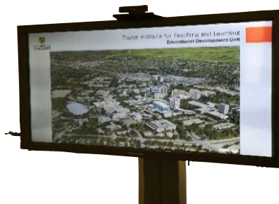
COLLABORATION CART WITH 55" DISPLAY SHOWING AN IMAGE EXPORTED FROM A POWERPOINT PRESENTATION